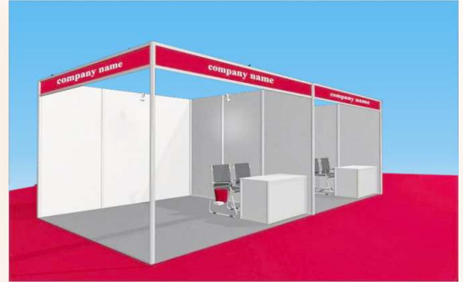
Sample Stall Layout (Example)